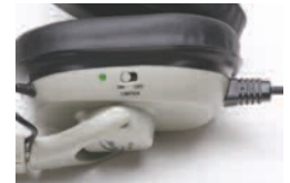
85dB switch built into earcup