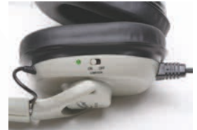
85dB switch built into earcup

Guaranteed for Life™ headset cord cross-section