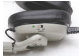
85dB switch is built into the earcups