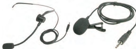
HBM319 Headset Mic