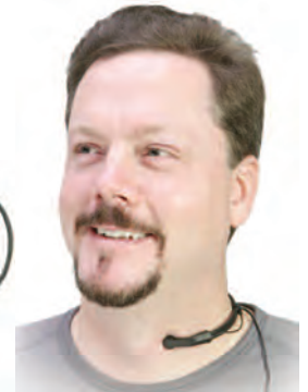
NM319 Neck Mic

The M319 transmits wireless audio to all of these Califone PA Systems