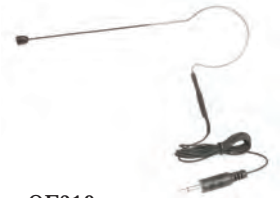
OE319 Over Ear mic