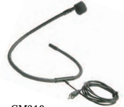
CM319 Collar Mic