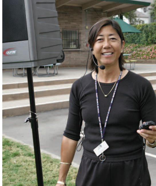
The M319 works with these five hands-free mics

The M319 can be used with any of the mics shown on this page. For use in outdoor settings, Califone recommends the Neck Mic (shown far right). Wrapping comfortably around the throat, the NM319 picks up sound vibrations from the vocal cords, eliminating disruptive wind noises or other factors which can adversely affect the quality of the audio.